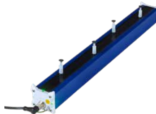
ThunderION 2.0 without support brackets, end brackets and sideplates for easy cleaning