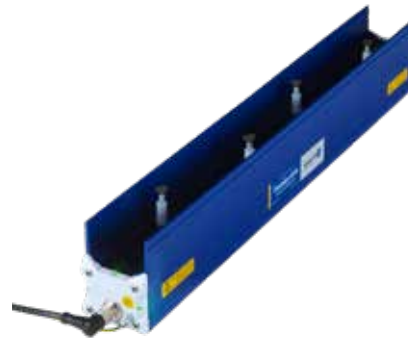
ThunderION 2.0 without support -and end brackets for easy cleaning