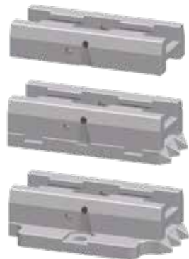
Universal mounting brackets